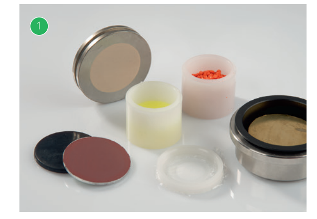
Liquids, loose powders and solids

Epsilon 1 can handle a large variety of sample types, weighing a few 100 milligrams, to larger bulk samples: solids, pressed powders, loose powders, liquids, fused beads, slurries, granules, films and coatings. Also large and irregularly shaped objects with maximum dimensions of 15 x 12 x 10 cm (W x D x H) can be analyzed.