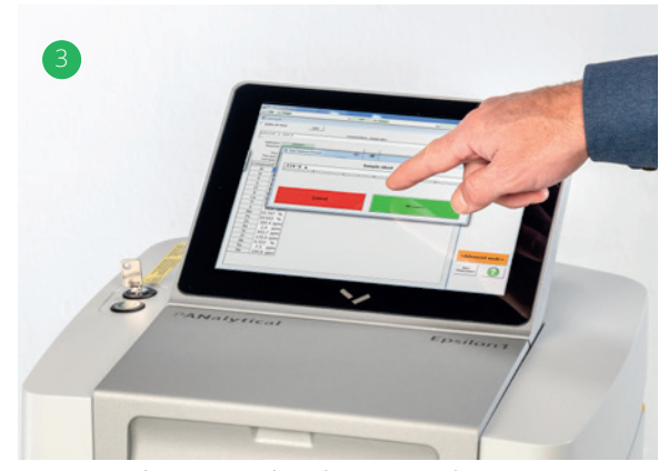
Enter sample name and push 'measure' button.