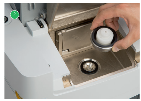
Place your sample for measurement.